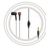
Lenovo™ In-ear Headphone