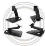
Lenovo™ Universal All-in-One Stand