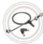
Kensington® Twin Head Cable Lock from Lenovo™