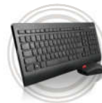
Lenovo™ Ultraslim Wireless Keyboard and Mouse Combo