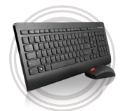
Lenovo™ Ultraslim Wireless Keyboard and Mouse Combo Fast & Fluid