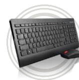
Lenovo™ Ultraslim Wireless Keyboard and Mouse Combo Fast & Fluid