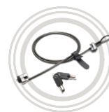
Kensington® Twin Head Cable Lock from Lenovo™ Ultra Protection against Thieves