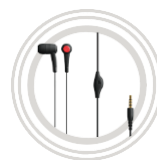
Lenovo™ In-ear Headphone Simple & Comfortable