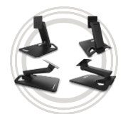
Lenovo™ Universal AIO Stand Rotate, Tilt and Adjust