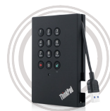
ThinkPad® USB 3.0 Portable Secure Hard Drive Fast & Secure