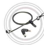
Kensington® MicroSaver® Security Cable Lock by Lenovo™ Ultra Protection Against Thieves